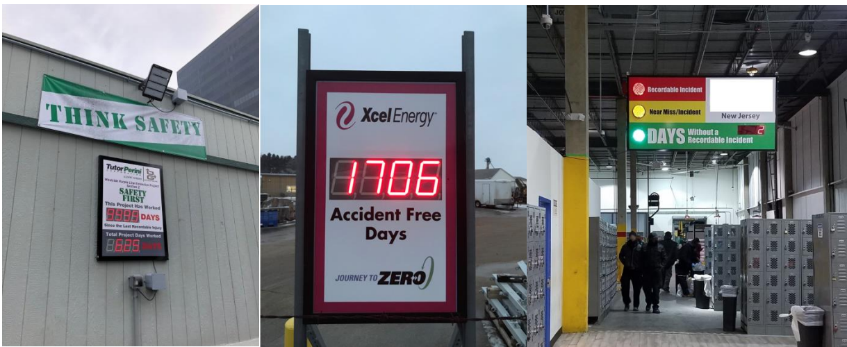
Examples: Left to right: bracket or bolt through backer, post mount through enclosure side, hanging mount